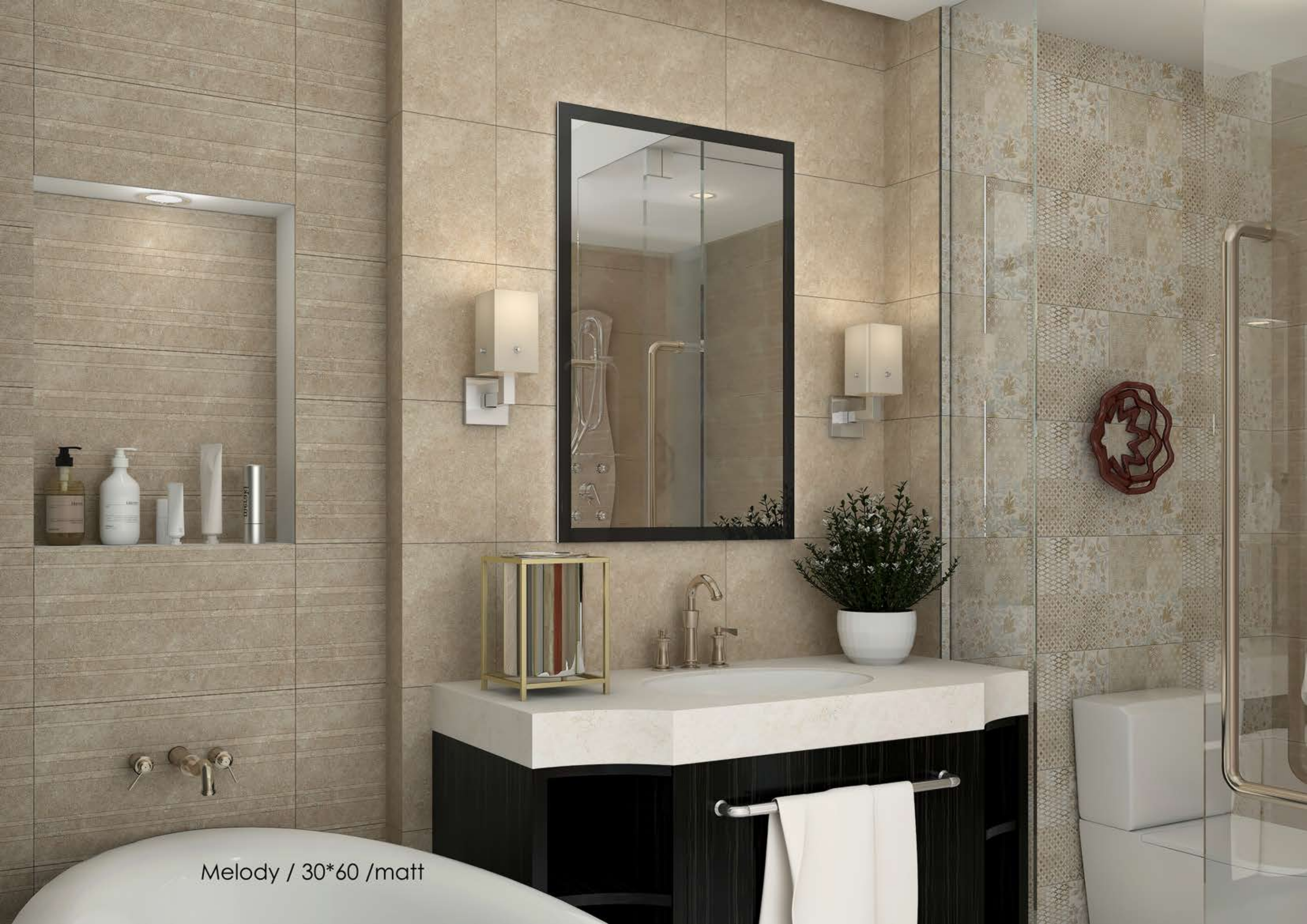
Melody / 30*60 /matt