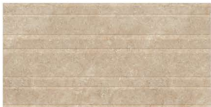
Melody / 30*60 /matt