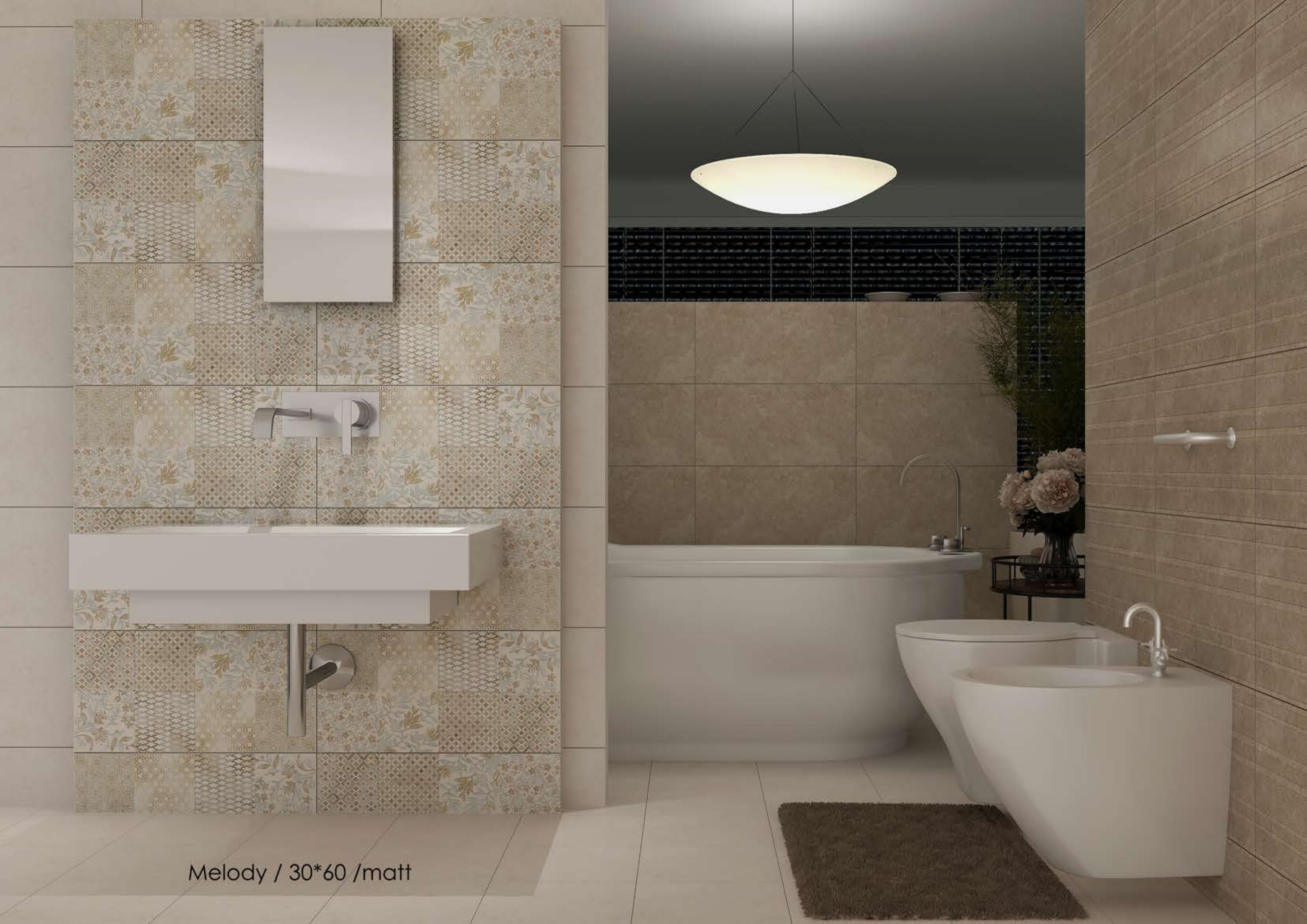
Melody / 30*60 /matt