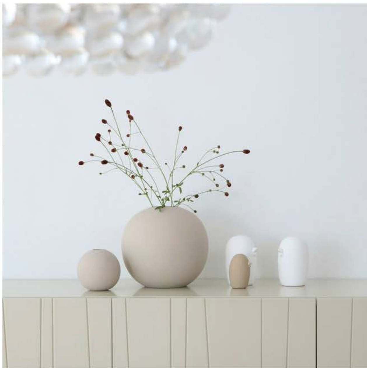
Melody / 30*60 /matt