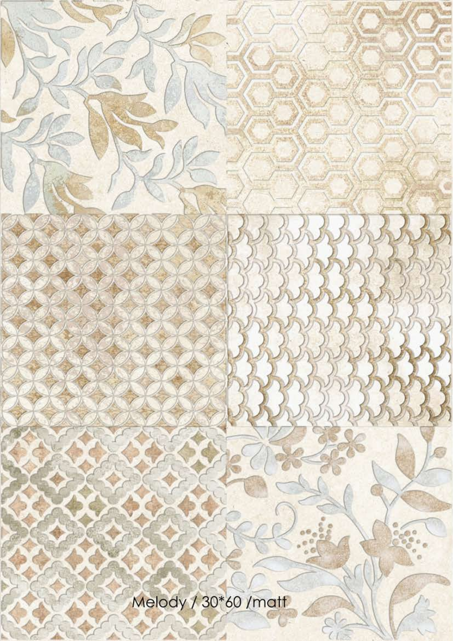
Melody / 30*60 / matt