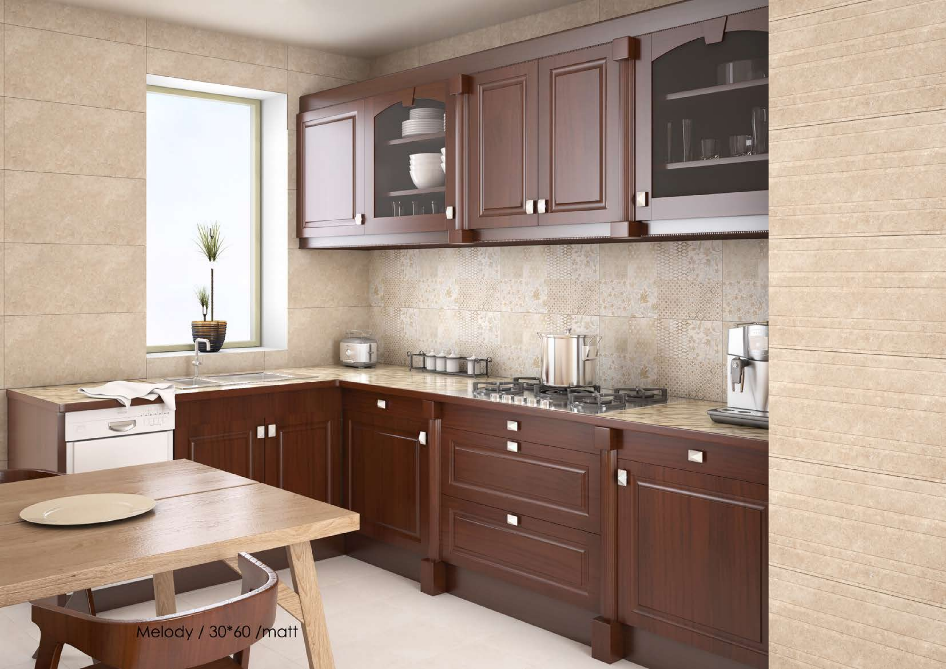
Melody / 30*60 / matt