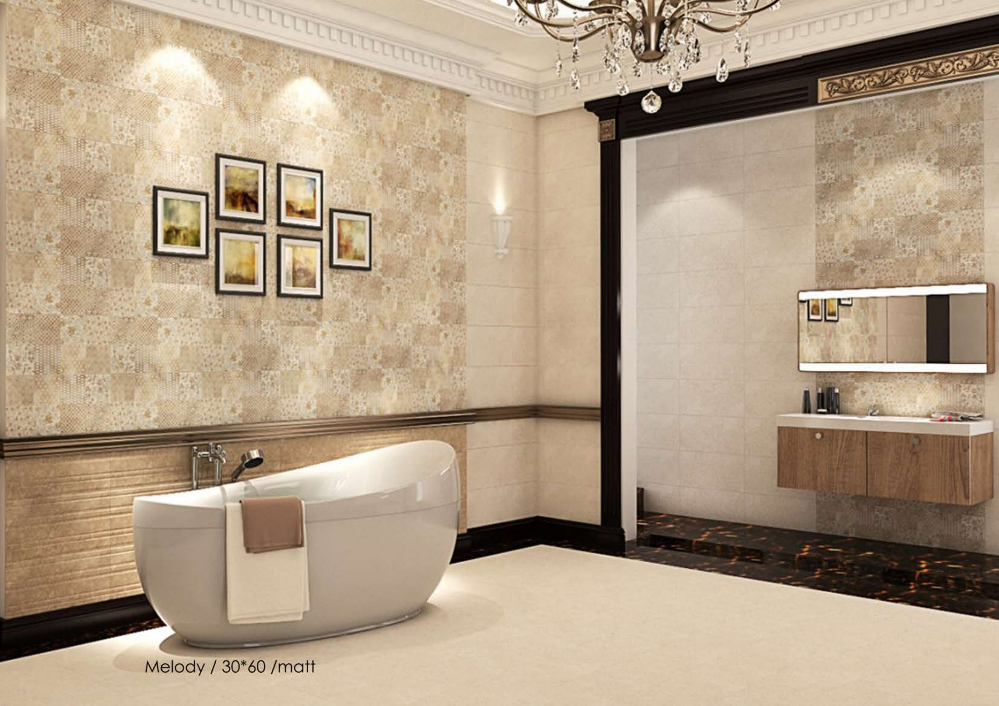
Melody / 30*60 /matt