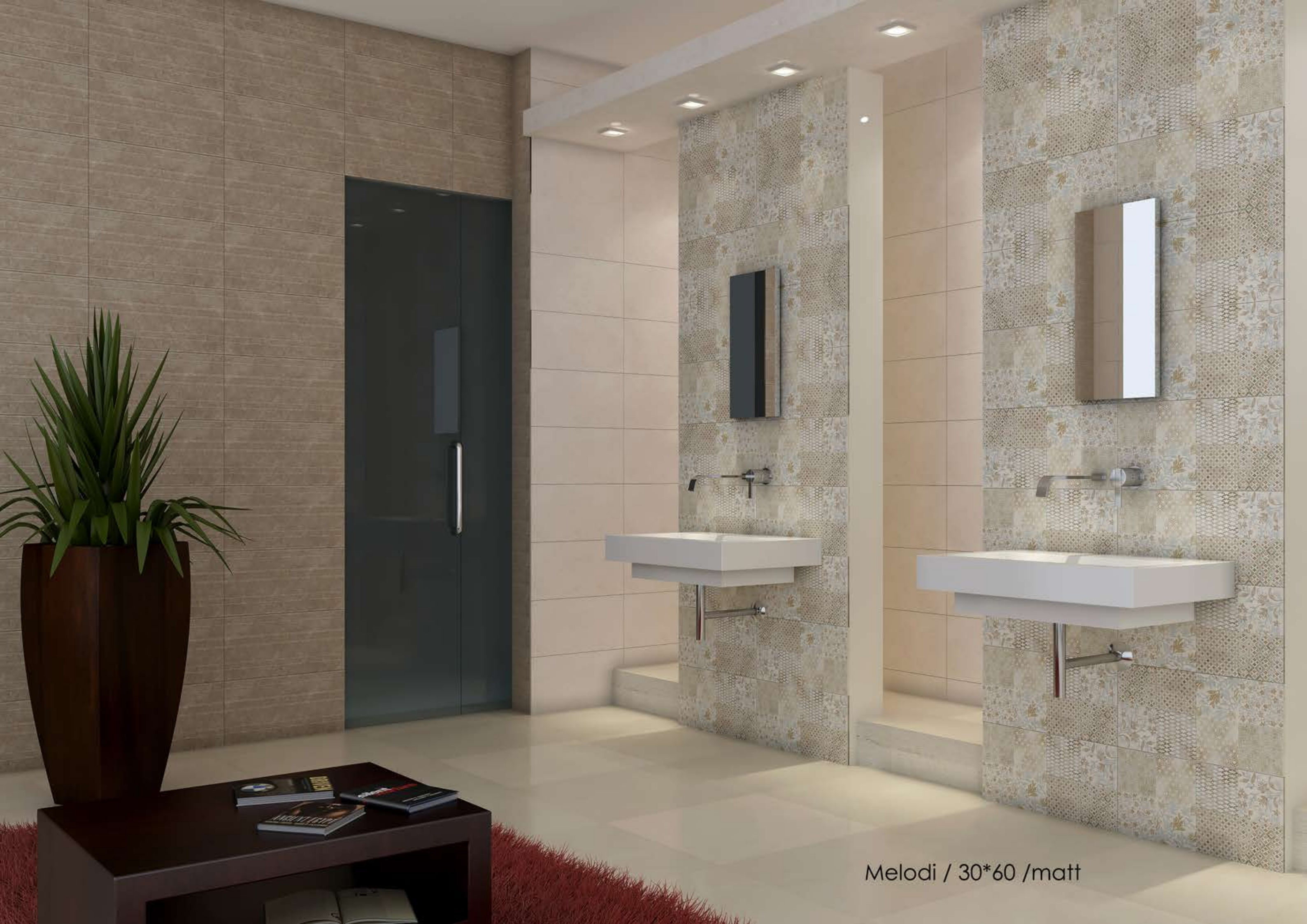
Melodi / 30*60 /matt