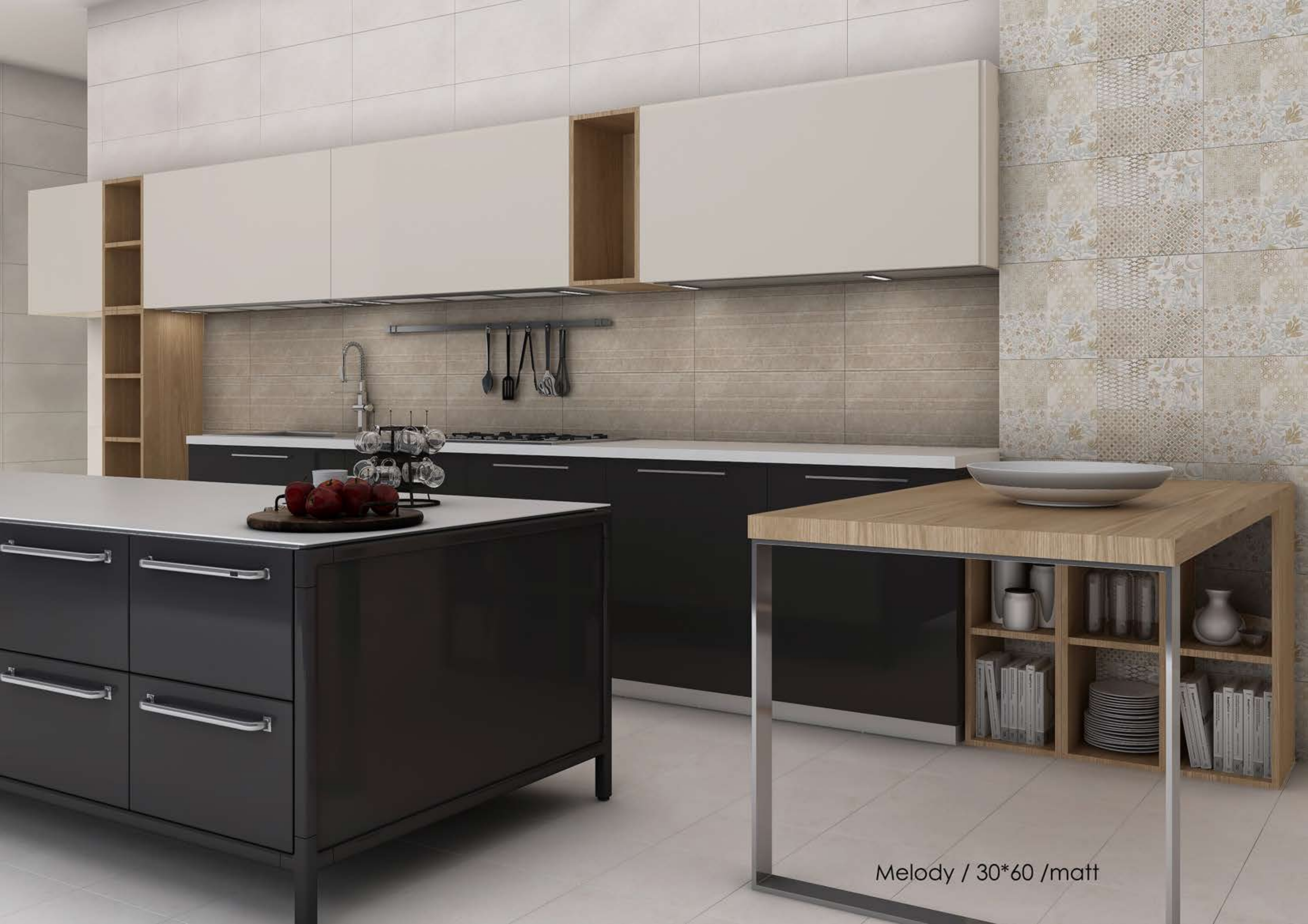
Melody / 30*60 /matt