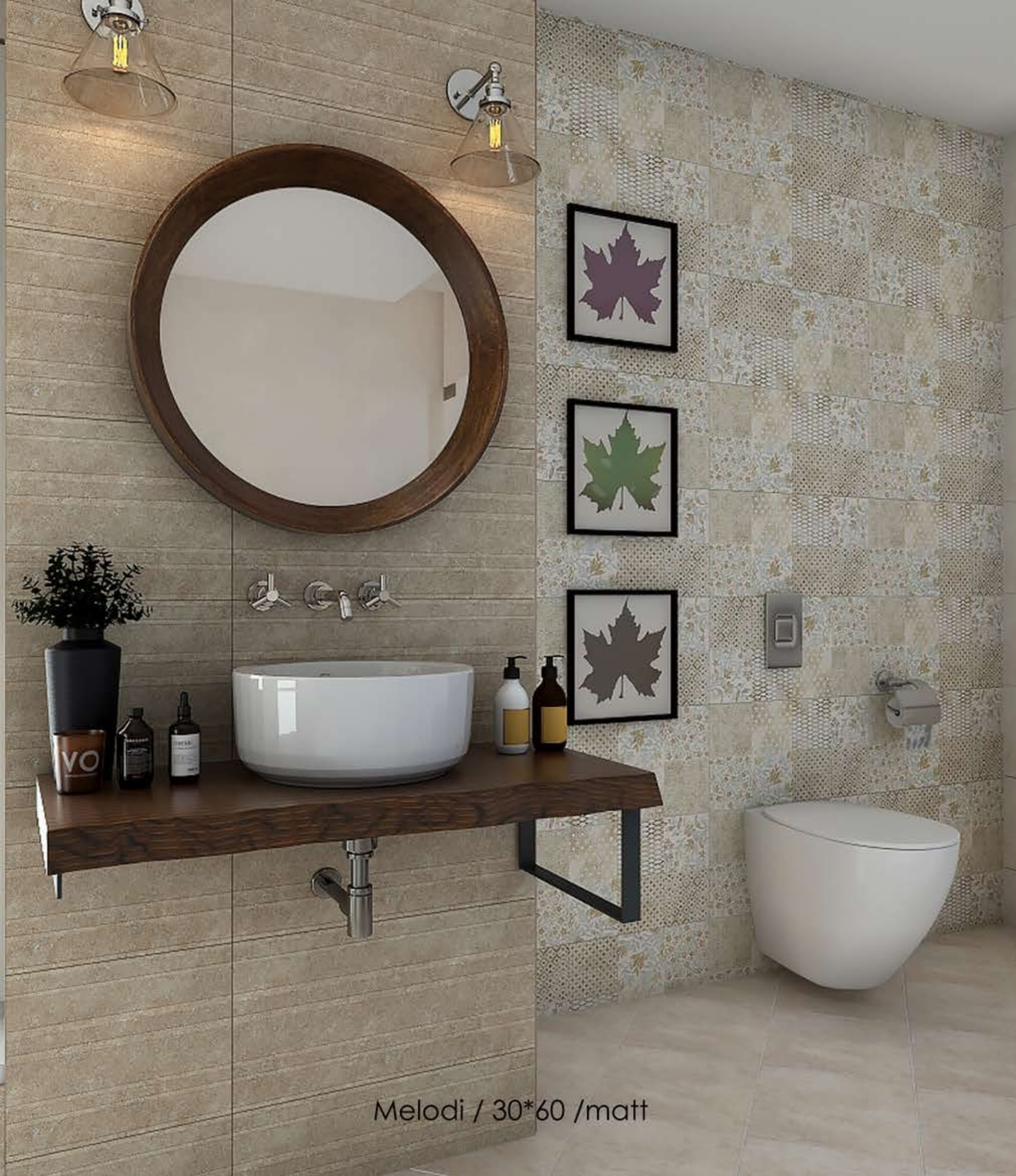
Melodi / 30*60 /matt