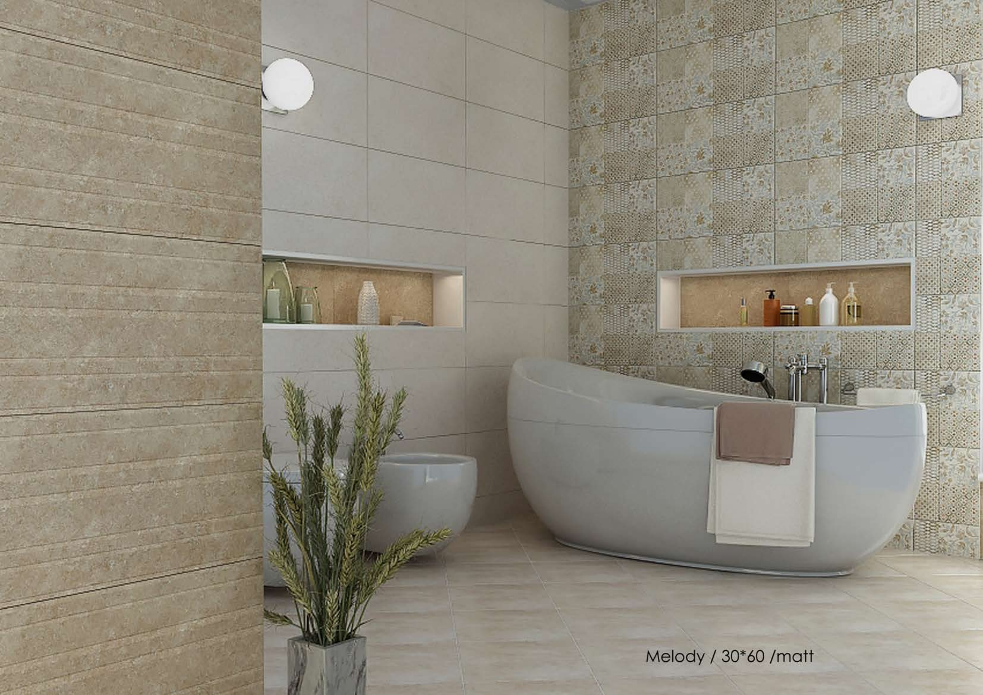
Melody / 30*60 / matt