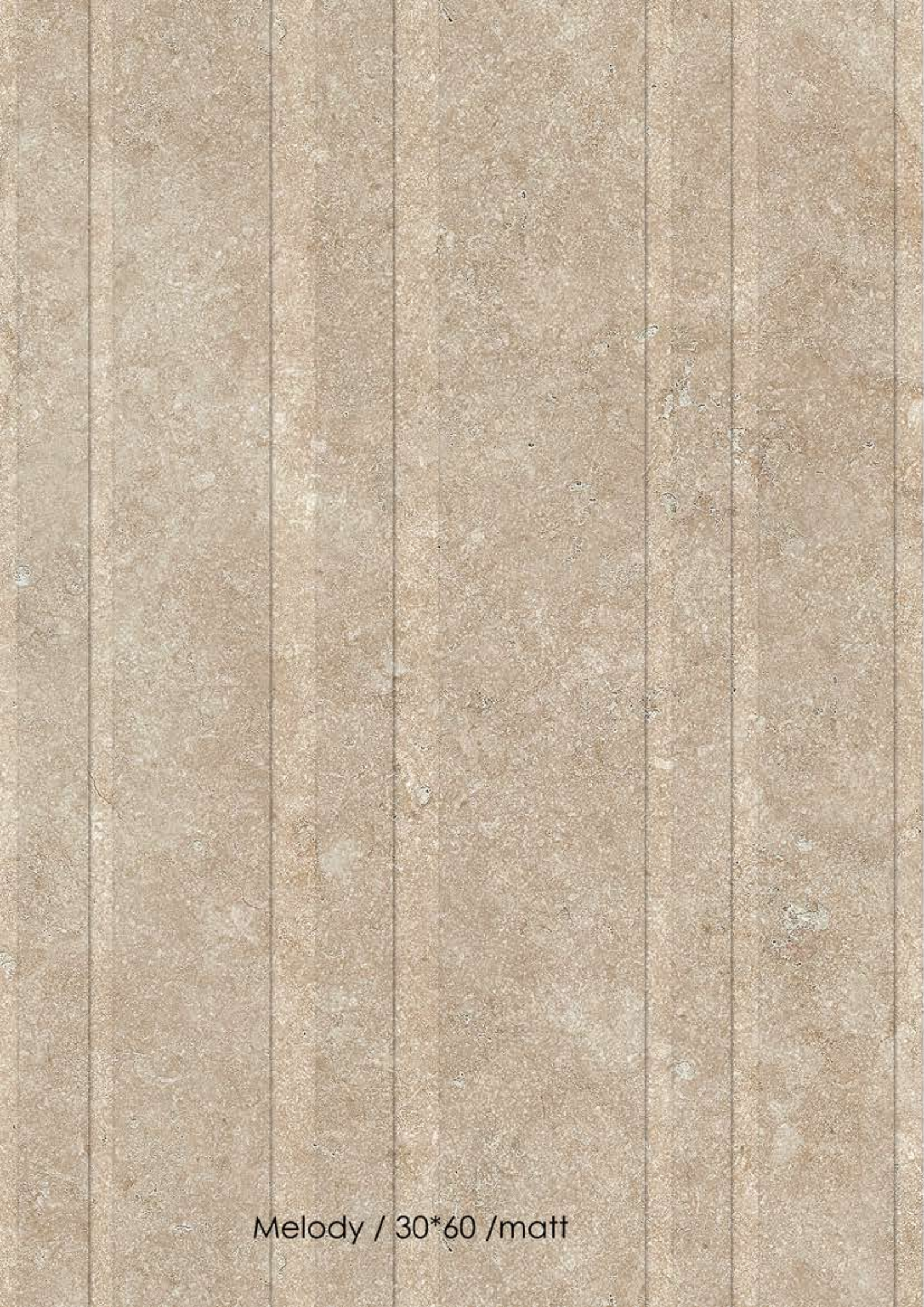
Melody / 30*60 /matt